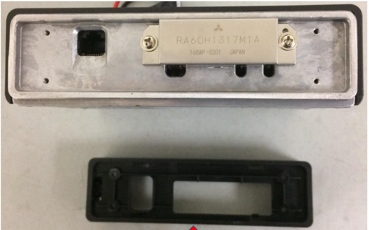
Remote Mounting Bracket

You now have a Remote Mounting Bracket you can use to remotely mount the head. If you would like a spare or rather not take the Remote Mounting Bracket off the radio, we sell additional brackets for $15.